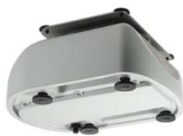
BW Series - Bottom View