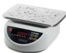
BW Series - Large Pan Accessory