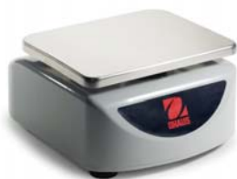
BW Series - Rear View